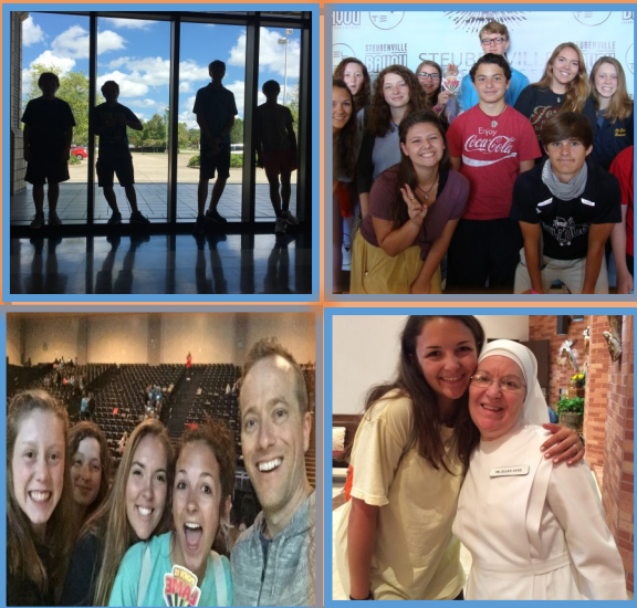
Steubenville on the Bayou & "A Day of Service" at the LSP Home in Mobile, AL

Stay tuned for news about CYO Spring and Summer Adventures 2018 . You don't want to miss next Summer's Adventures!